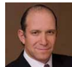
Howard W. Lutnick Chairman and CEO BGC Partners, Inc.