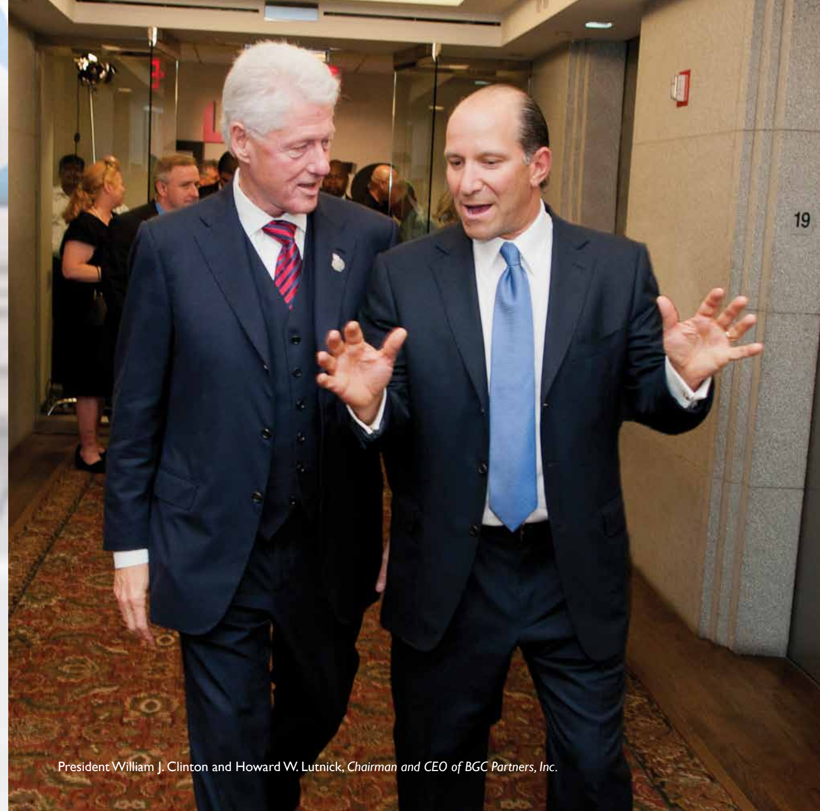
President William J. Clinton and Howard W. Lutnick, Chairman and CEO of BGC Partners, Inc.