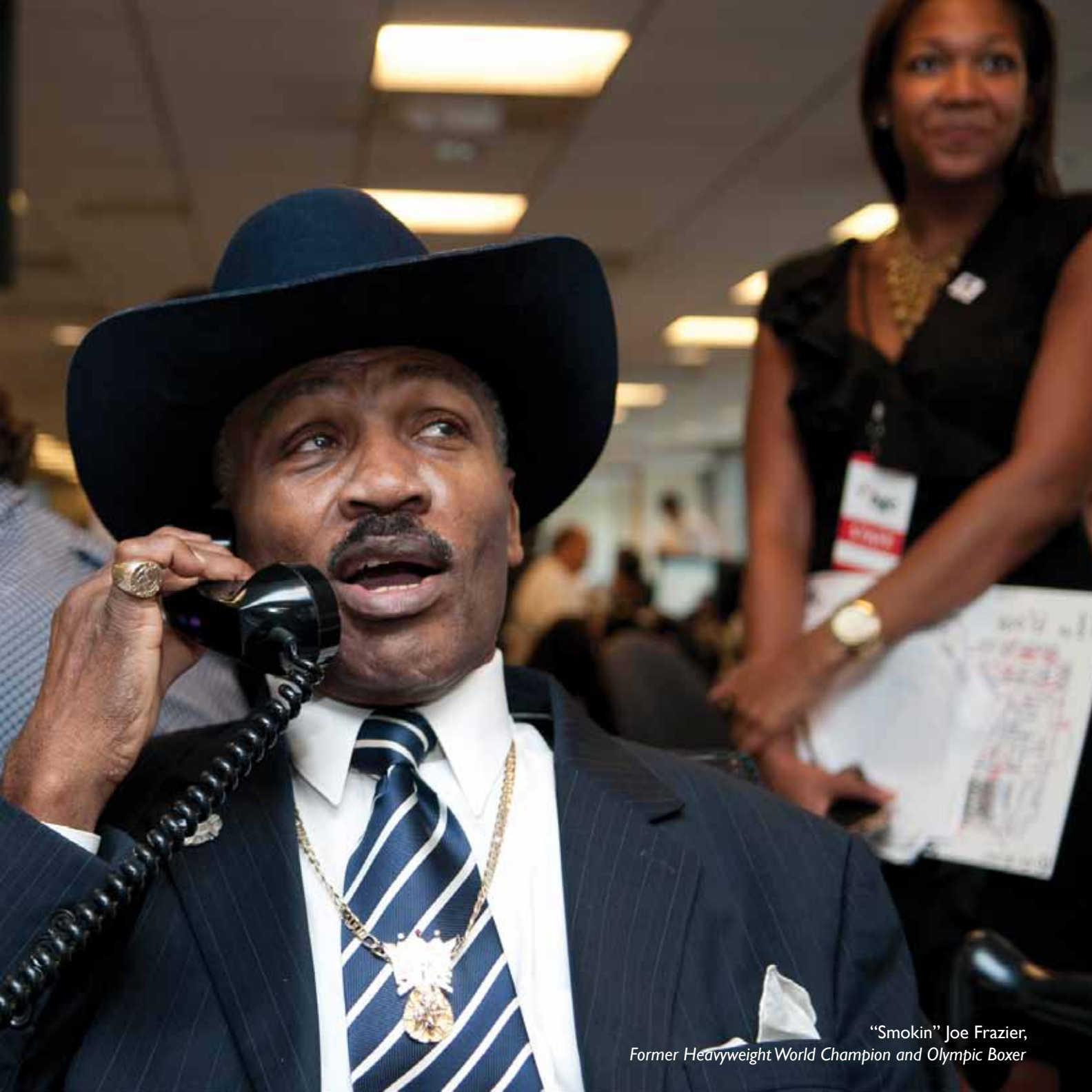
“Smokin” Joe Frazier, Former Heavyweight World Champion and Olympic Boxer