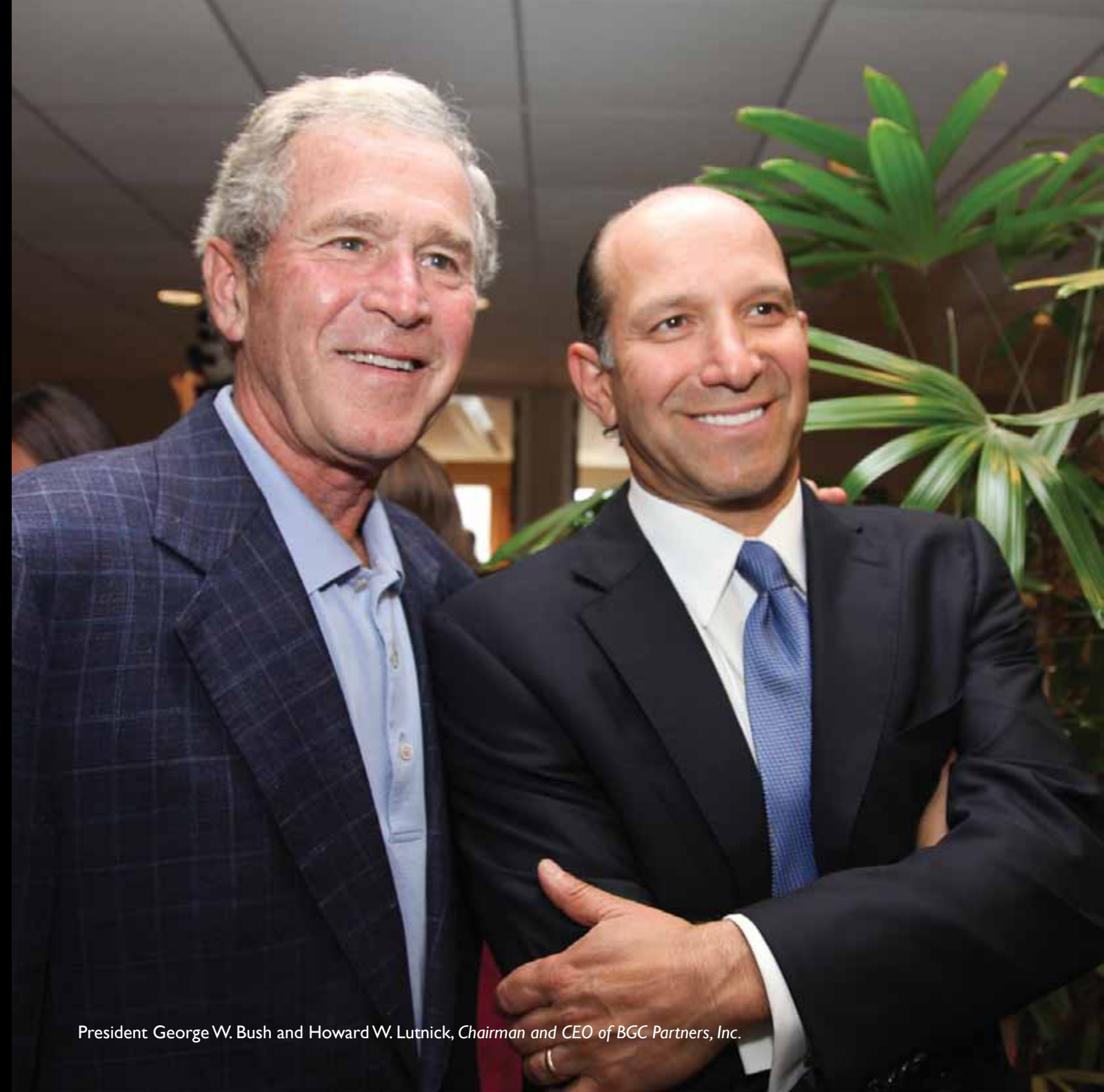
President George W. Bush and Howard W. Lutnick, Chairman and CEO of BGC Partners, Inc.