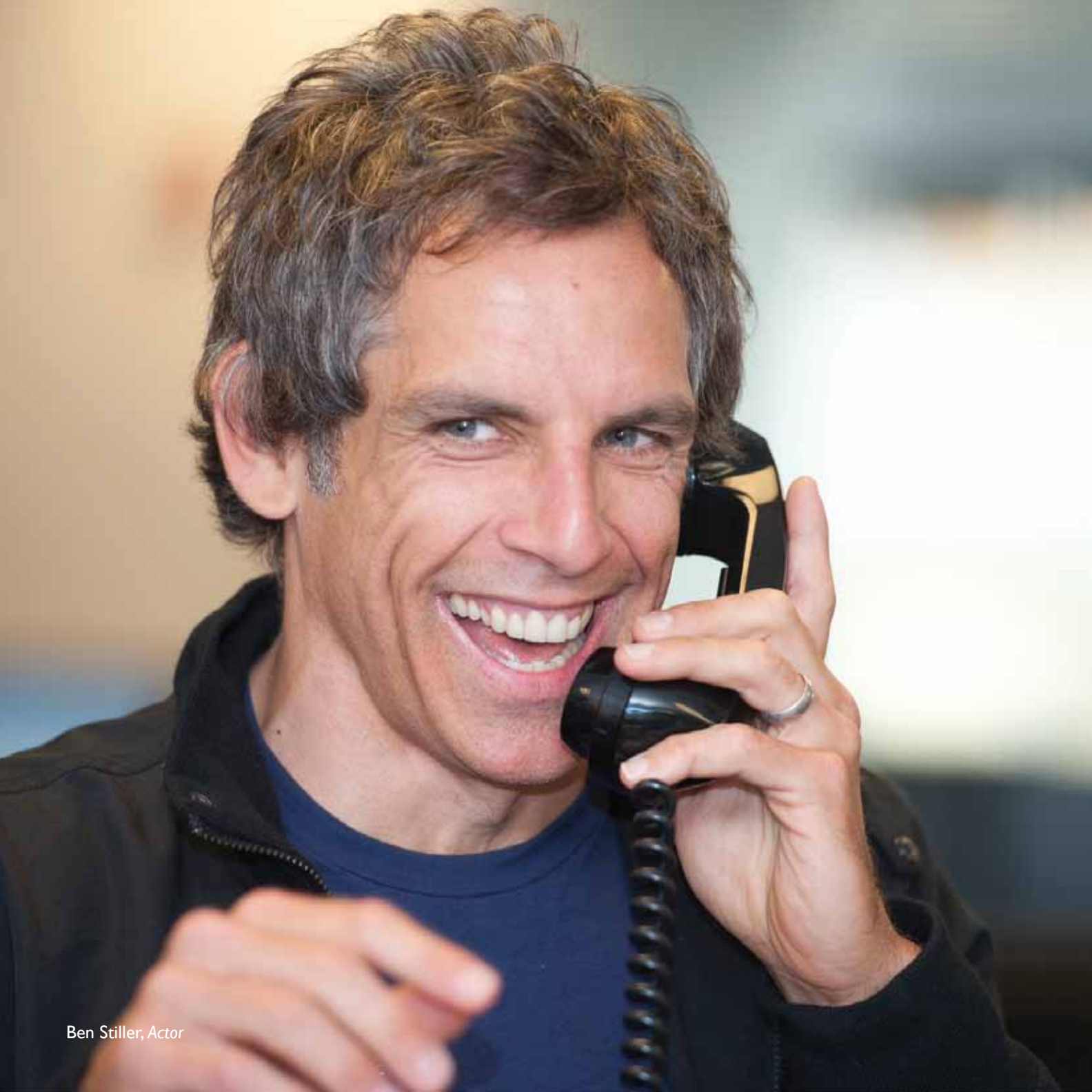
Ben Stiller, Actor

“Thank you again for your invitation to the 7th Annual BGC Charity Day. It was impressive and rewarding to see the support you had for a day that you and your firm have dedicated to support many great charitable organizations.”