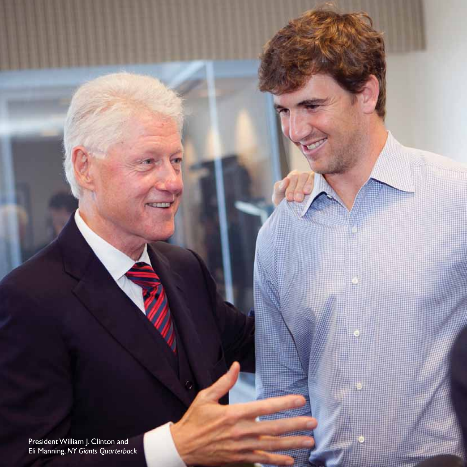
President William J. Clinton and Eli Manning, NY Giants Quarterback